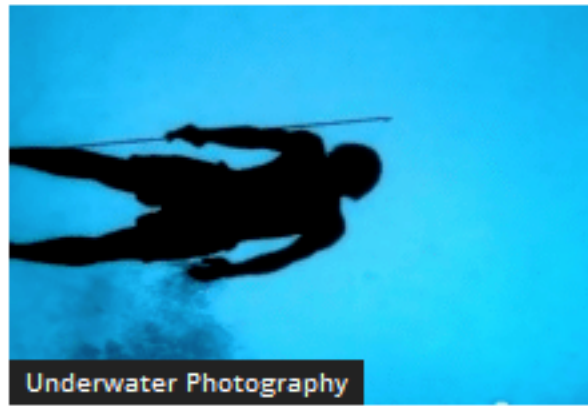
'Sailing A Sinking Sea' Documentary Due For Release On May 13