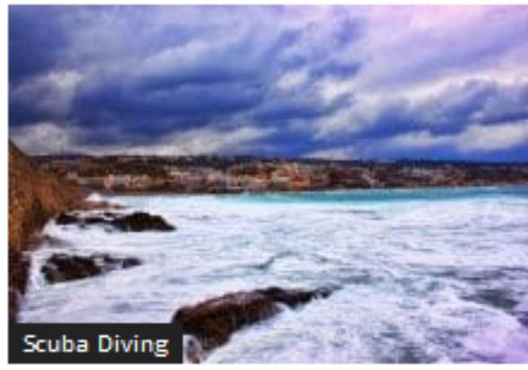
To Dive or Not To Dive