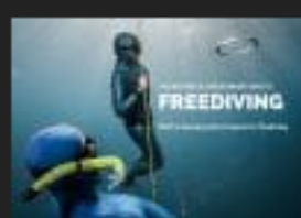
Glossary and Acronyms of Freediving May 4, 2016