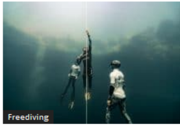
BREAKING: William Trubridge Extends World Record for Second Time