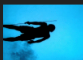
'Sailing A Sinking Sea' Documentary Due For Release On May 13 May 4, 2016